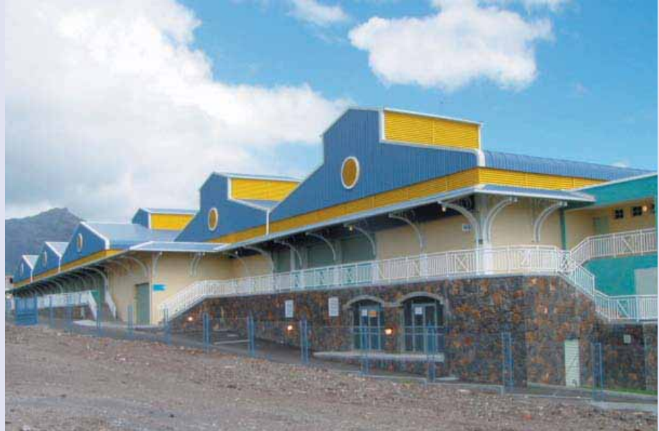
New Market Fair at Cité Martial