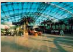
Flughafen Frankfurt Main AG

Fag - was founded in 1924 as a joint stock company. it is member of all airport related national and international organizations and is strongly engaged in the development of planning criteria, handling procedures, management techniques and business principles. fag owns and controls almost all buildings of the frankfurt airport which today comprises about 17 km 2 .